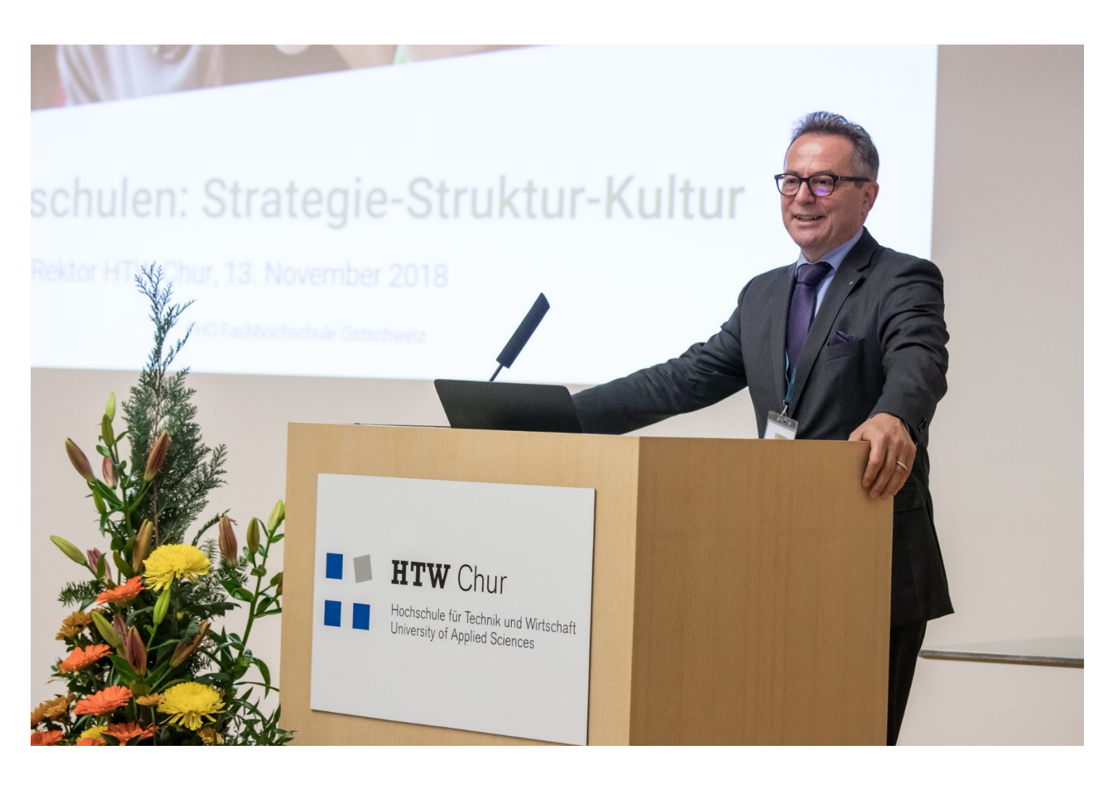
"University of Applied Sciences: Strategy - Structure - Culture"